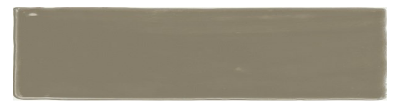
OLIVE GLOSS NC222681